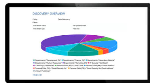
Data Discovery scan report

All 'ITAR for SafeShare' customers receive the same quality support.